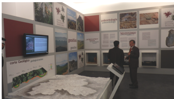
The new Visitor Reception Center in Cañamero.