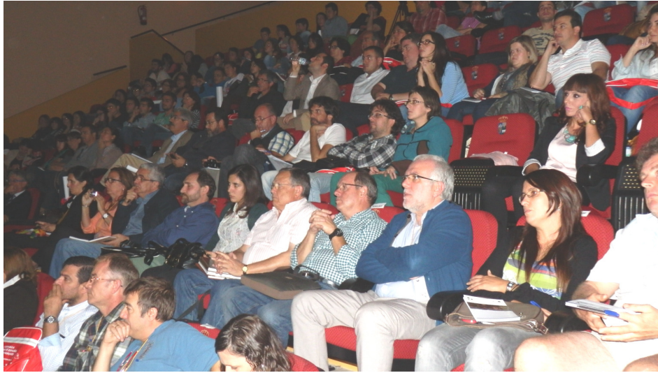
First Open Seminar of the Spanish Geoparks Committee in Guadalupe.